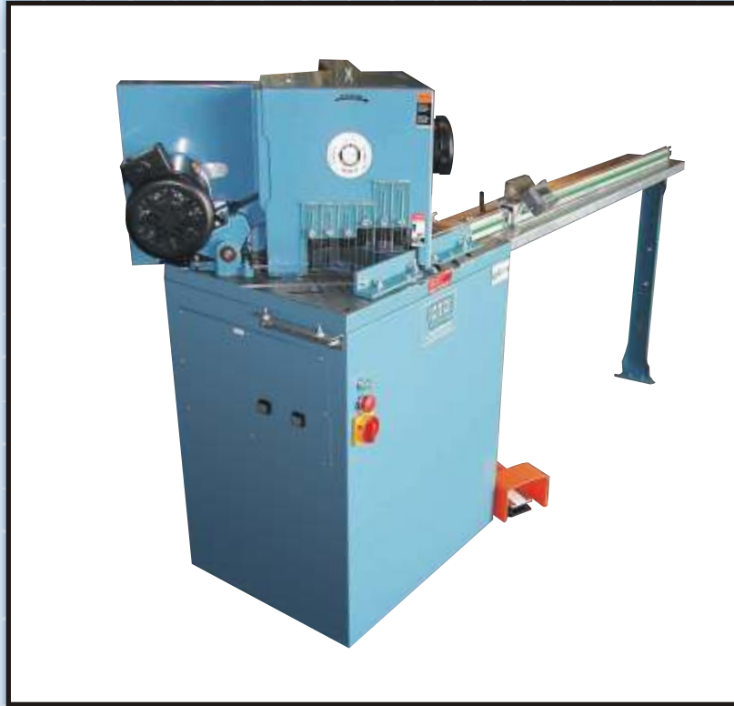
D45AX Shown Less 60" Infeed Table for Photo Detail Purposes

Designed to provide accurate mitered cuts and precision cut-to-length parts. Downward motion of sawing action eliminates blowout of moulding pattern details.